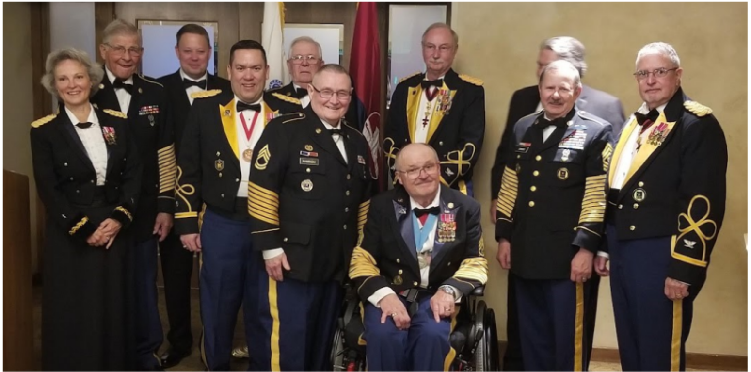
The 84th Railsplitters Association held its Annual Dining Out this past May. It is always a pleasure to see so many friends and family—and many in uniform! I envy them as the closet fairies have taken my blues and made them quite small!